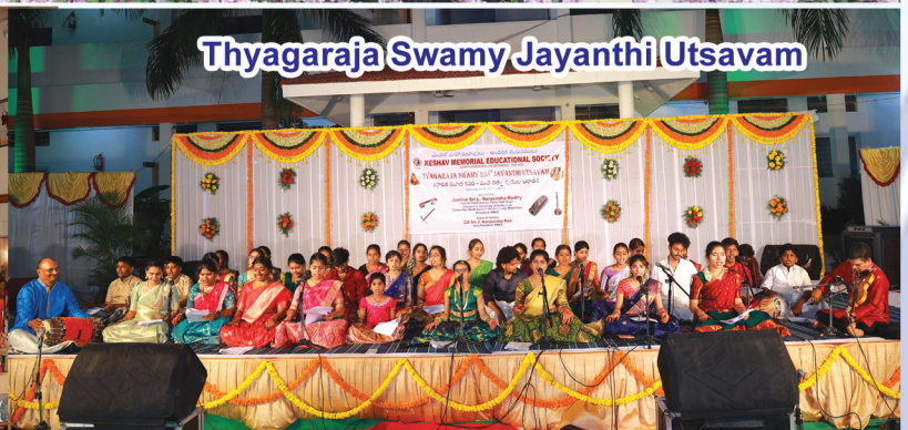
Thyagaraja Swamy Jayanthi Utsavam