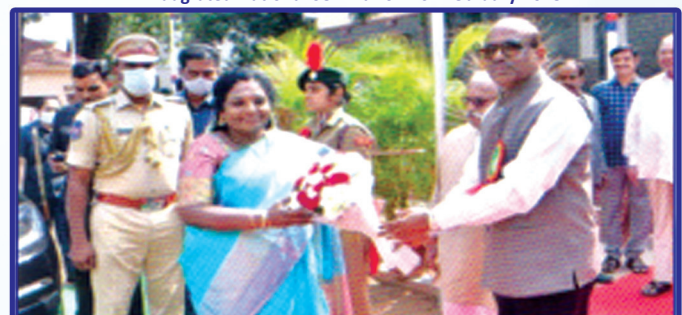
Hon'ble Governor of Telangana Smt. Tamilisai Soundararajan Visited our Campus on 26 th November 2022