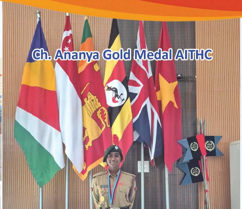
Ch. Ananya Gold Medal AITHC

Most students have shown a keen interest in Artificial Intelligence (AI), Machine Learning, Blockchain, and Communication Skills-all of which are available on Swayam through expertly curated courses. These courses help learners gain industry-relevant skills, making them more competitive in the job market. With flexible learning schedules and recognized certifications, Swayam is an excellent opportunity for students to upgrade their knowledge and career prospects.