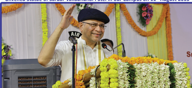
Hon'ble Minister for Railways Sri Ashwini Vaishnaw Visited our Campus on 18 th July 2025