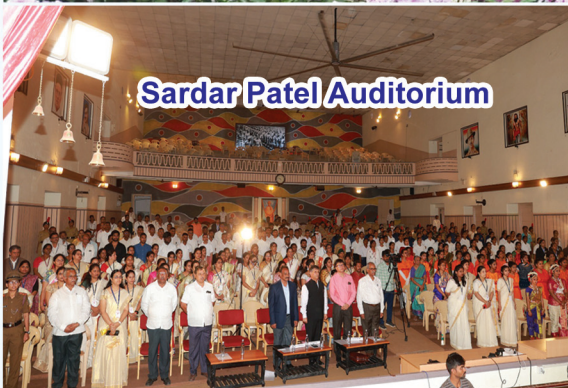
Sardar Patel Auditorium