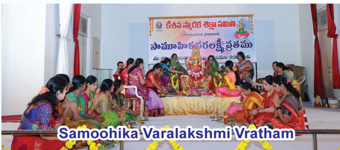
Samohika Varalakshmi Vratam