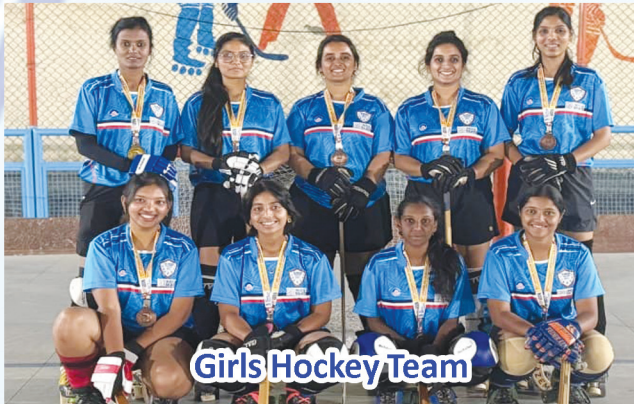
Girls Hockey Team

Our students are encouraged to participate in various sports and Games. Their talent is identified, nurtured and encouraged. As a result, we see many achievements every year consistently.