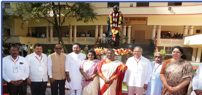
Hon'ble President of India Smt. Draupadi Murmu Visited our Campus on 27 th December 2022