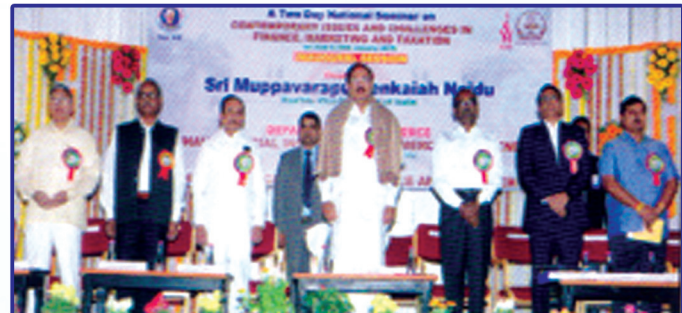
Hon'ble Vice President of India Sri M. Venkaiah Naidu inaugrated National Seminar on 16 th February 2018