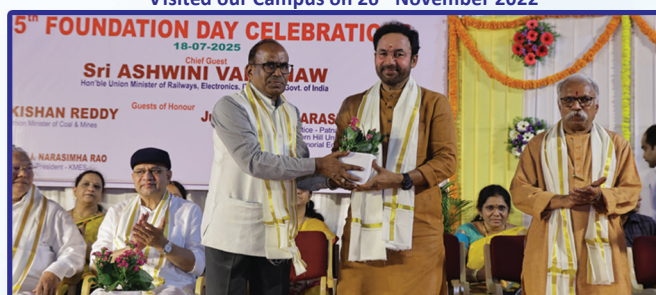
Hon'ble Union Minister for Coal and Mines Smt. G. Kishan Reddy Visited our Campus on 18 th July 2025