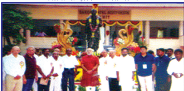
Hon'ble Prime Minister of India Sri Narendra Modi Unveiled Statue of Sardar Vallabhbai Patel in our Campus on 11 th August 2013